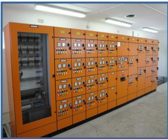
PLC AND MOTOR CONTROL CENTER