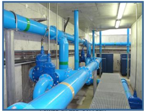
LOWER FILTER GALLERY