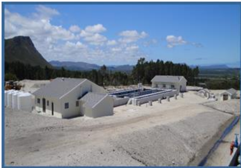
FRANSKRAAL WATER TREATMENT WORKS